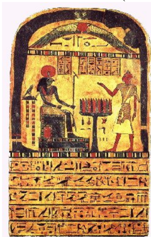
Figure 4: The Stele of Revealing

One of the tests that Crowley gave his wife was to show him an image of Horus. They went to the Egyptian museum in Cairo and, to Crowley's amusement, Rose passed by a number of the hawk-headed god's image, and led him to this stele. (See figure 4)