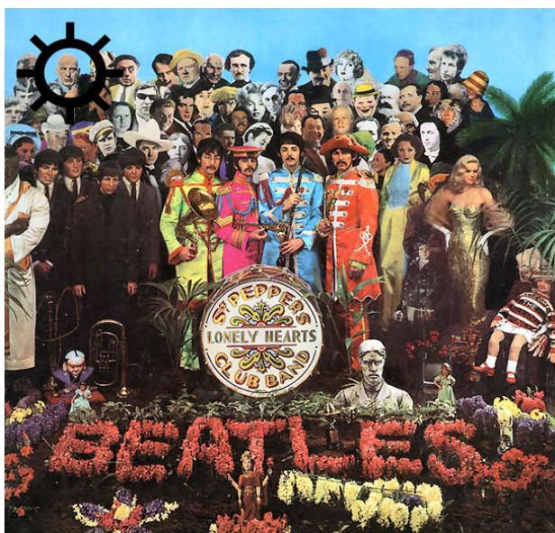
Figure 1. The Beatles

In the upper left-hand corner of the Beatles' "Sgt. Pepper's Lonely Hearts Club Band" album (see Figure 1), second in from the left of the top row of the group the Beatles proclaimed "people we like," is the image of Aleister Crowley. Crowley, one of the most notorious men in 20 th Century England, was heralded by the popular press of his time as the "wickedest man in the world." He was also a poet, mystic, mountaineer, magician, raconteur, social critic, libertine, drug user, founder of religious orders and a great many other things as well. Many books have been written (including a number by himself) about who Aleister Crowley was and what he did. The "who" of Mr. Crowley has been dealt with in great detail; what is of greater relevance and importance in this instance is to discuss "what" he was.