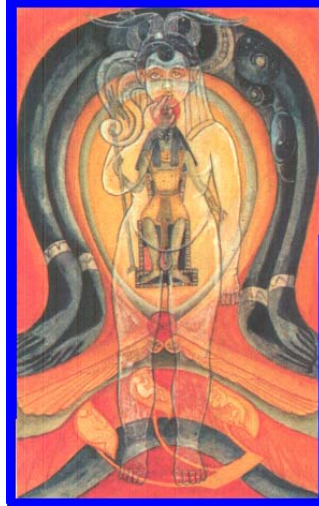
Figure 6 – The Tarot trump, The Aeon 29