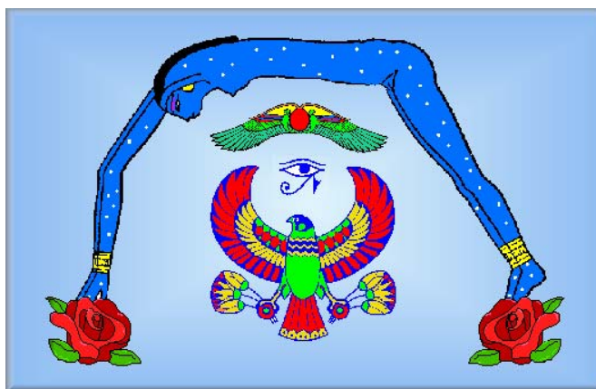
Figure 3: Nuit, Hadit and Ra Hoor Khuit.

One of the tests that Crowley gave his wife was to show him an image of Horus. They went to the Egyptian museum in Cairo and, to Crowley's amusement, Rose passed by a number of the hawk-headed god's image, and led him to this stele. (See figure 4)